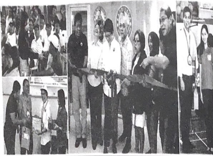
PCBI officials and coffee growers gathered for a coffee tasting event in Amadeo, Cavite.